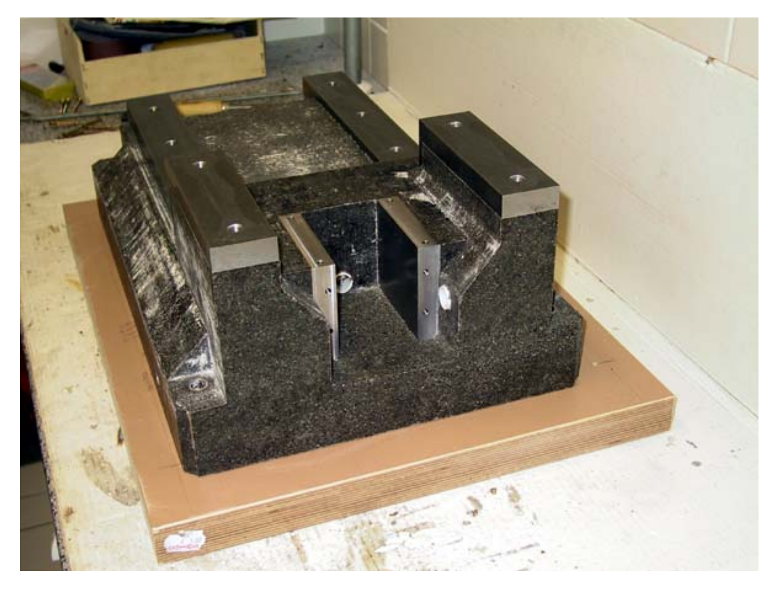
And the rear...