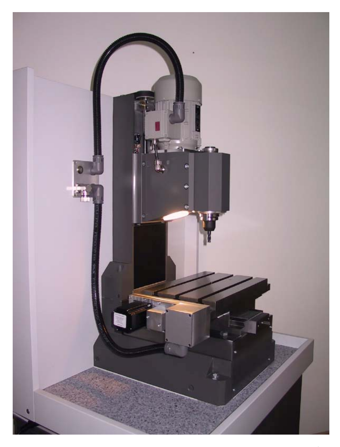
Note the built in light! Looks like that will be the enclosure. Another nice piece of work...