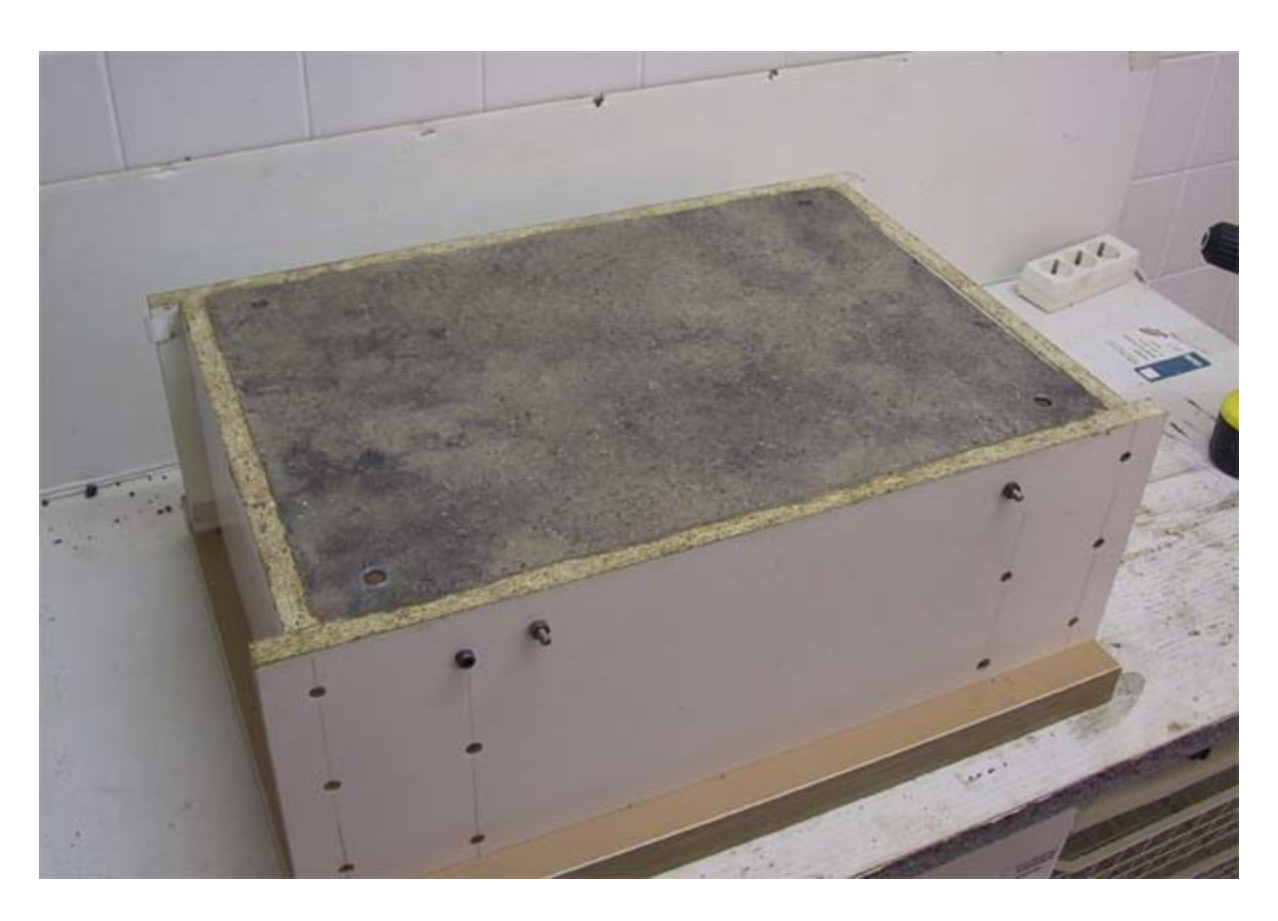
The Epoxy Granite Has Been Poured Into the Mold...