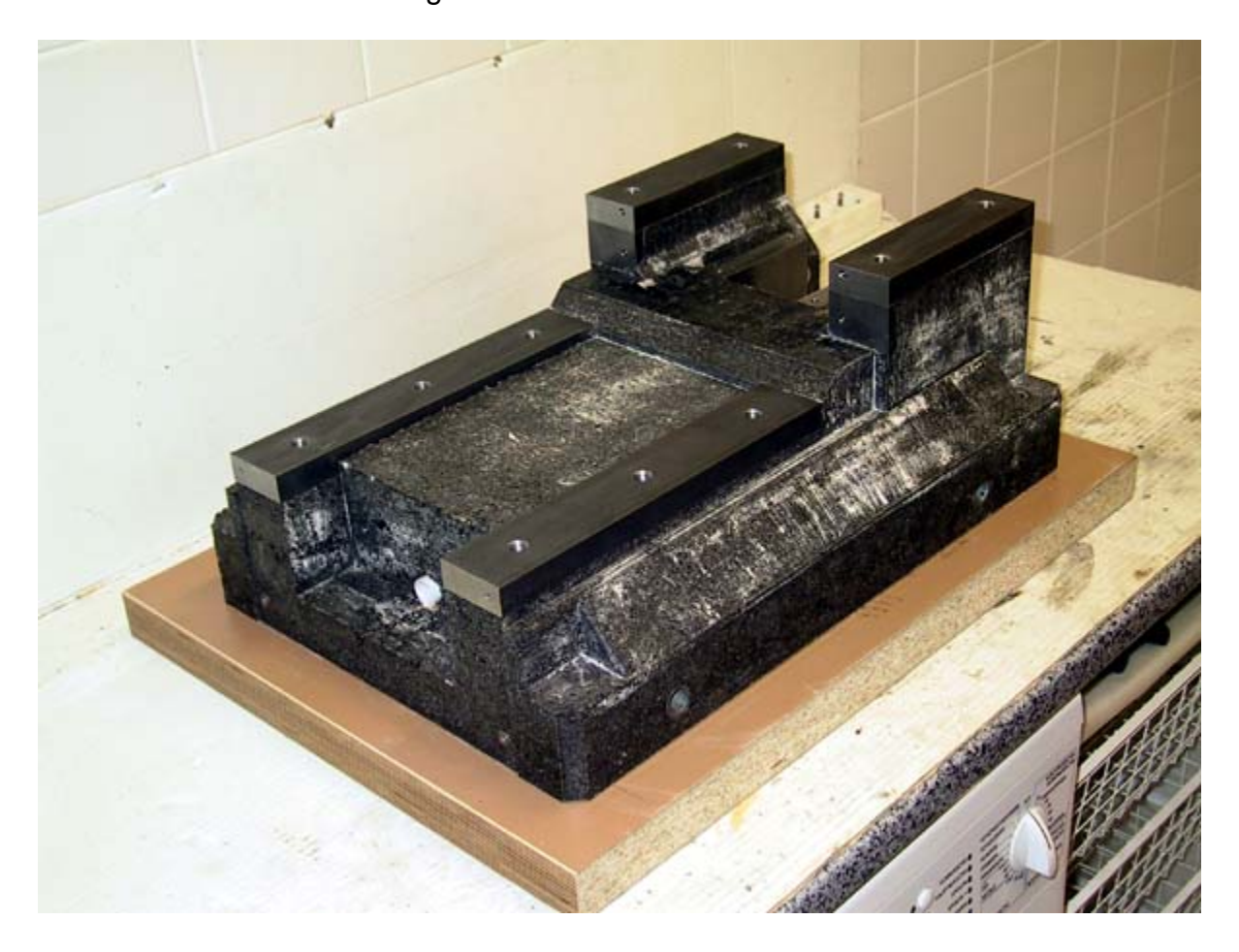
Front of the base. Note the precision steel pieces cast in place...