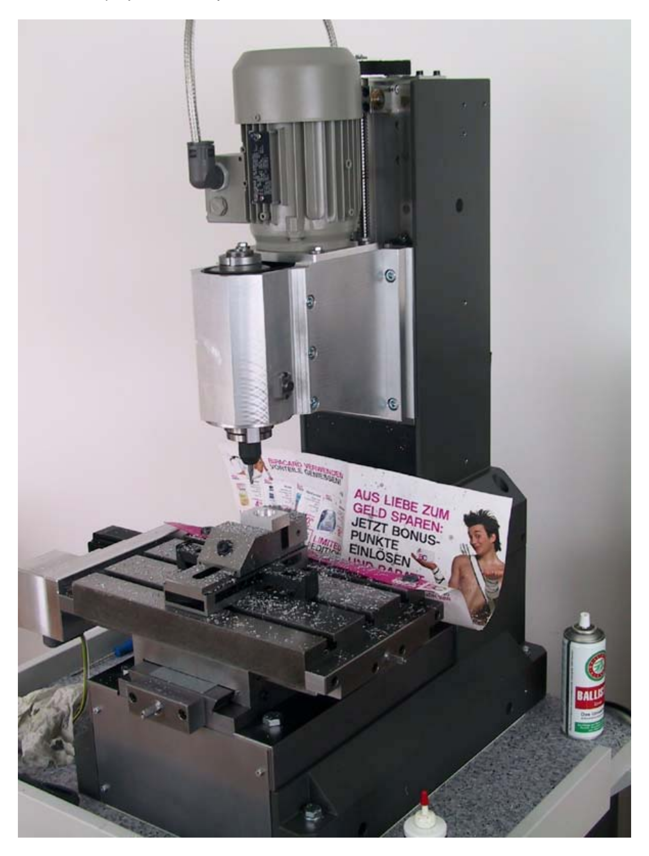
That machine is solid!

Here's an awesome project I recently heard about on CNCZone: