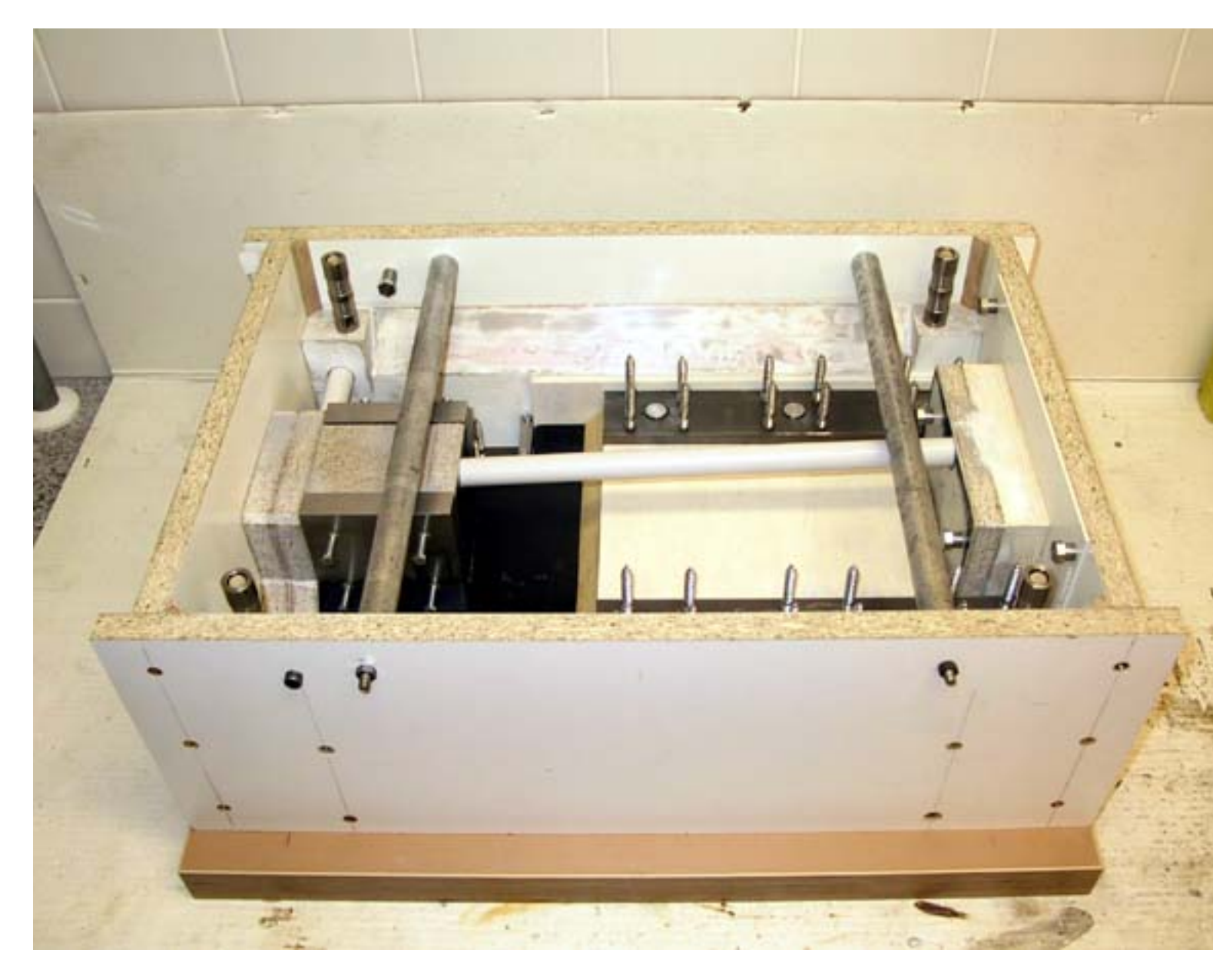
Mold for the base. This base will be case upside down. Note the screws sticking up from the metal parts--that's how they're anchored into the epoxy matrix...