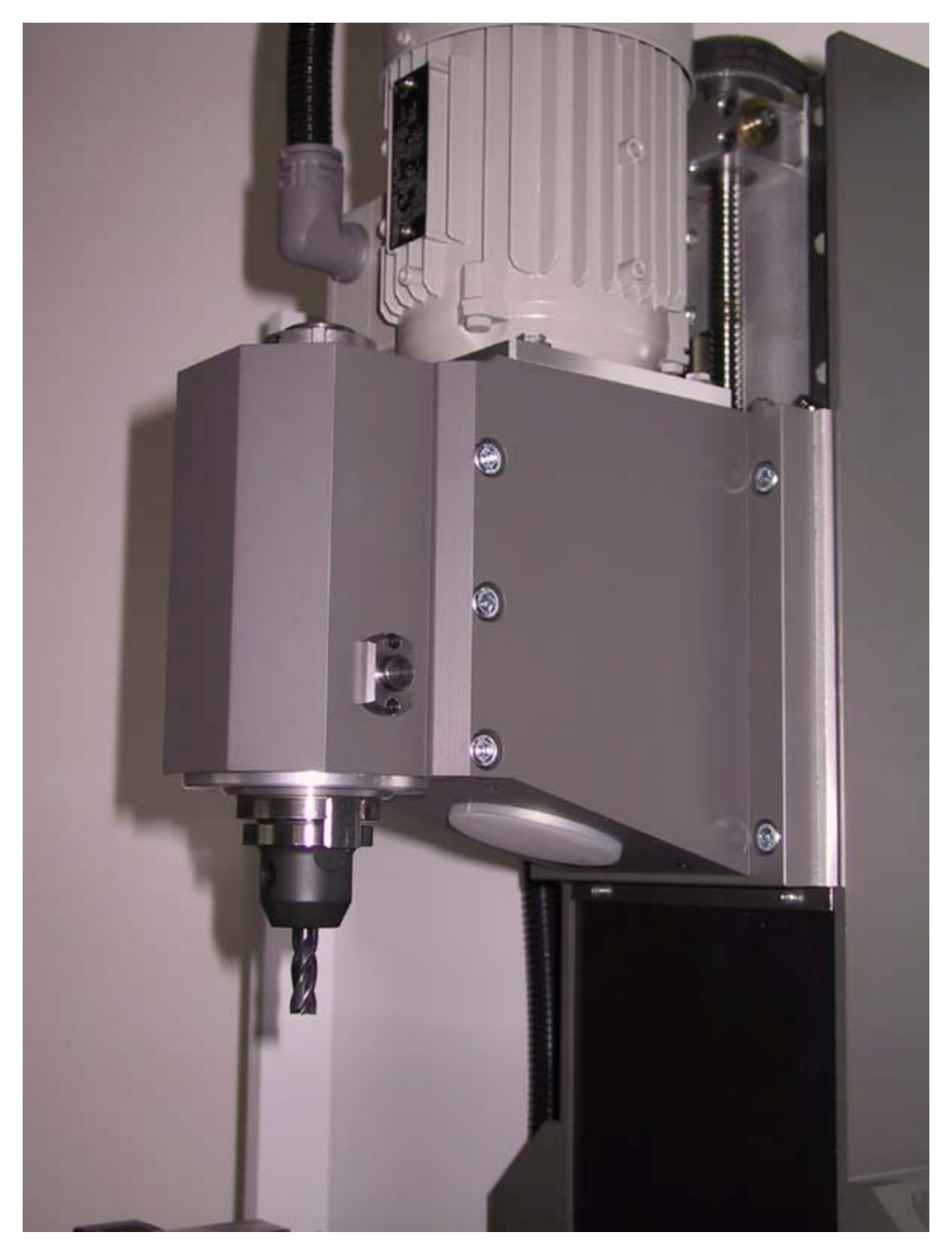
Not sure of the taper. The text mentions SK30. That's a release button on the side, so there must be a compressed air drawbar with bellville's or some such...