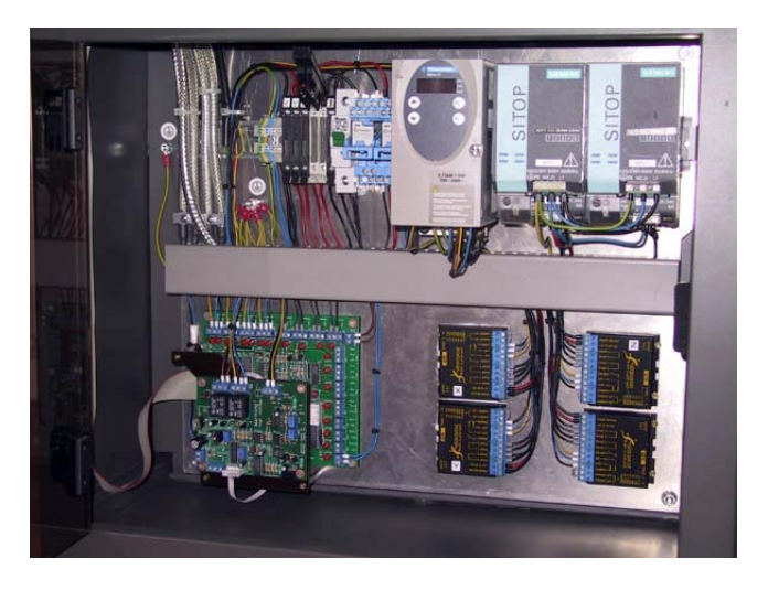
Extremely clean electronics chassis...