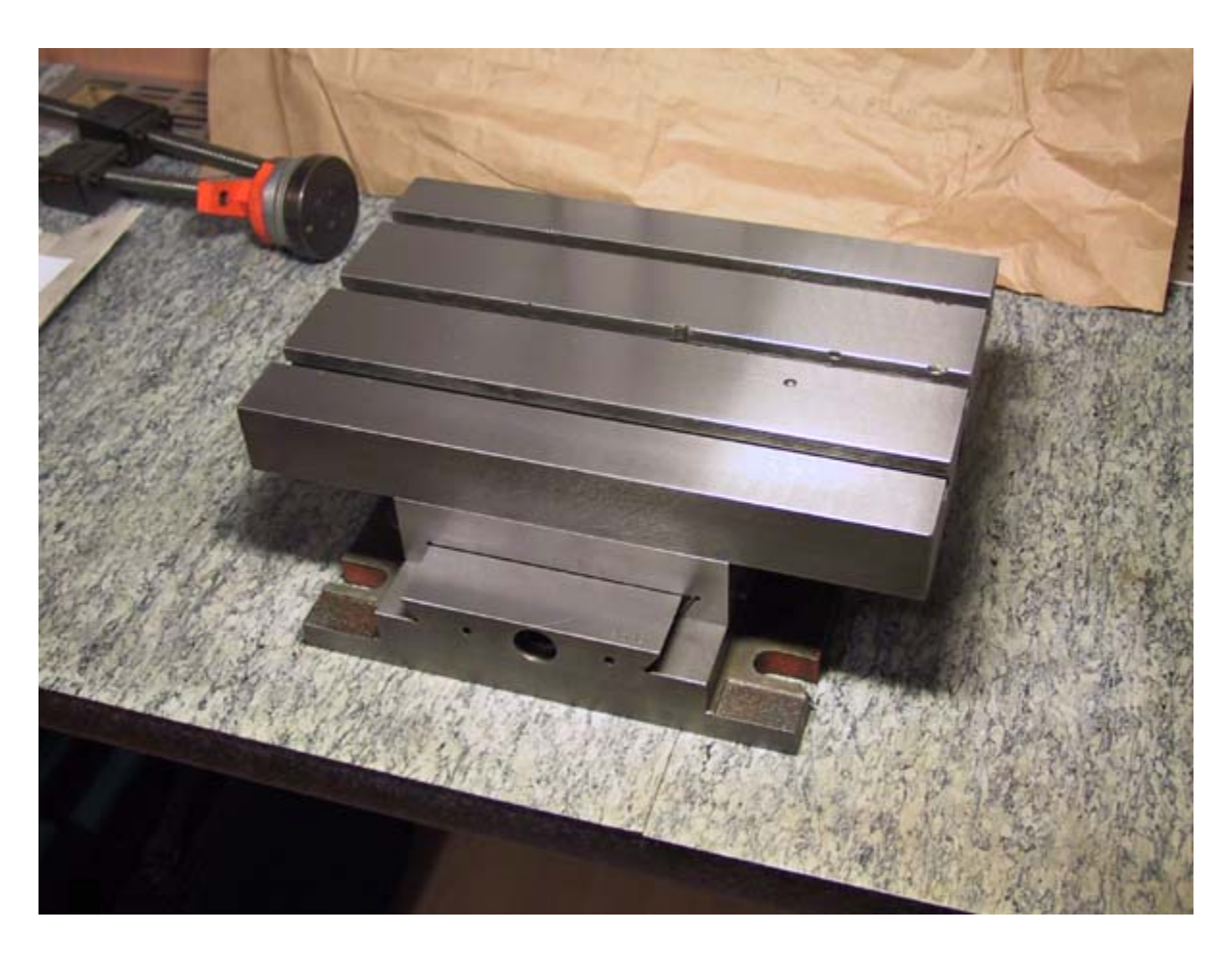
Table/Saddle Will Be Incorporated into the E/G Matrix...